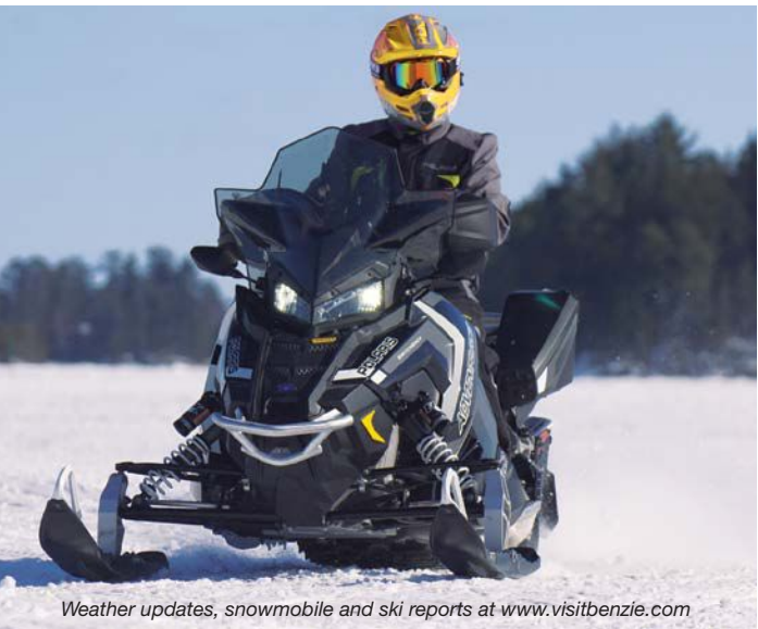
Weather updates, snowmobile and ski reports at www.visitbenzie.com

9685 US 31, Interlochen 231-276-9910 • 877-896-6714 www.longlakemarina.net Power sports dealer. Full service & storage